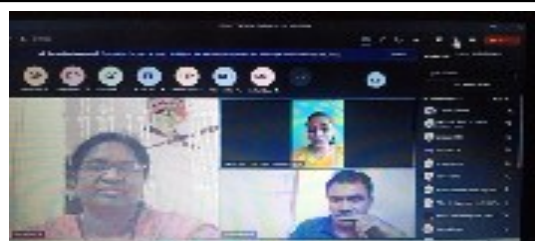
National Youth Day